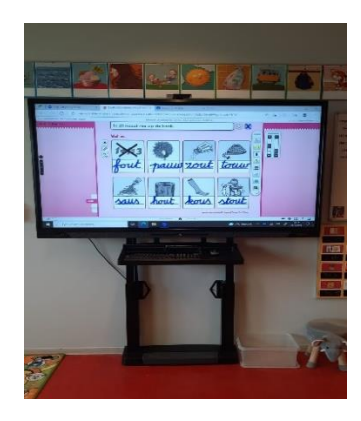
Walk-in toddlers (Group 1/2)

This week 26 new digiboards have been installed for the St@rtbaan and I-St@rt. Unfortunately we as a school had to wait a long time for this because of the chip shortages but it was worth the wait. They work well, are large and we can use them for the coming years.