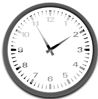
It's five to two.